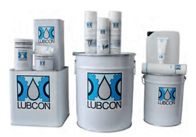
Minimise the risk of mixing up: LUBCON H1 lubricants are mostly sold in white packagings in order to easily differentiate from non-H1 lubricant.

Flushing the system is very often the only way to achieve adequate cleanliness and full performance of a new lubricant. Therefore, it is highly recommended to flush gearboxes and hydraulic systems when converting from conventional oil to H1 registered lubricants, e.g. with LUBCON<sup>®</sup> Turmoflush FG 15 (not miscible with Polyglycol oils).