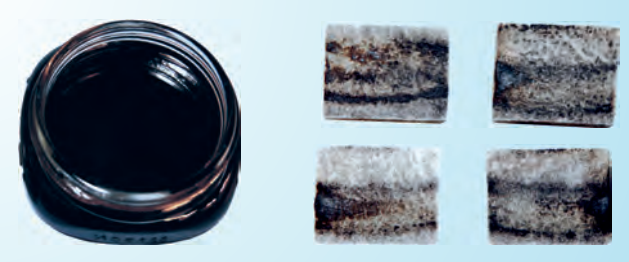
Fig. 2: Felt pads from slitter & scorer after treatment with Turmocut SR 15