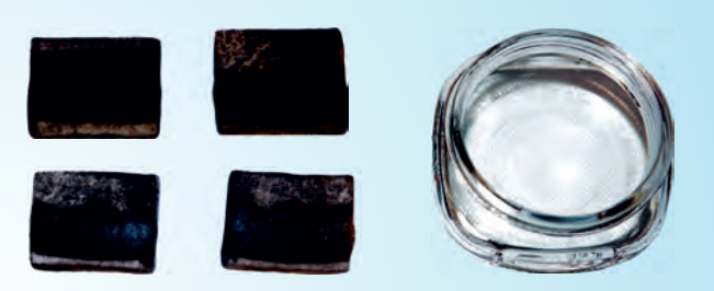
Fig. 1: Felt pads from slitter & scorer before treatment with Turmocut SR 15

Tests under harsh operating conditions have proven that Turmocut SR 15 has an excellent dissolving effect on starch residues and provides optimum felt penetration. Thus, the unique preservation and cleaning oil reduces the cleaning interval of stones and increases the service life of knives.