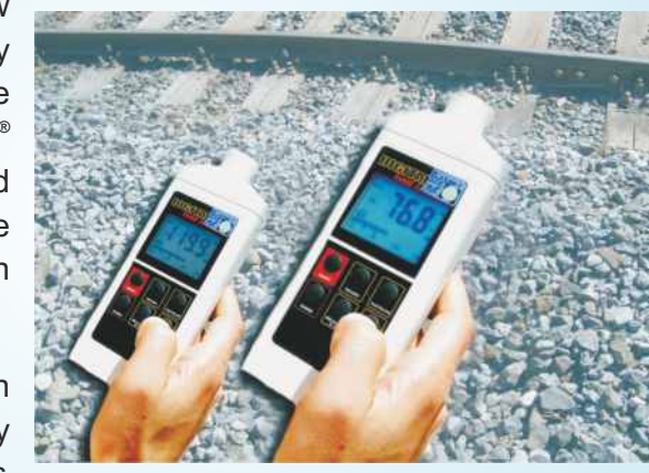
Evidently effective against squeaking and screeching: measurement prior to lubrication (left) and after application of Sintono® Terra HLK (right).

Sintono® Terra HLK can be applied on top of rail as well as on rail edges. It fulfills the criteria for braking and traction capability and is biologically degradable. It forms a lubricating film that is resistant to water and oxidation and sticks well to all surfaces. Moreover, the lubricant has a very good load carrying capacity.